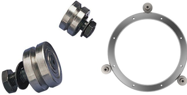
PRT2 guide wheels run on the matching vee surfaces of the ring or track. The guide wheels can be mounted internally or externally to the ring.