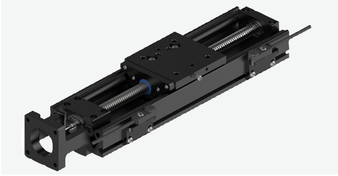
ECO60™ Linear Actuator