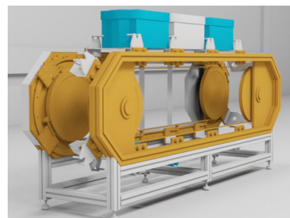
Parallel, vertically-mounted HepcoMotion® DTS track systems from Bishop-Wisecarver carrying buckets.

Augers, belt conveyors, and bucket conveyors are often used to move bulk materials for high throughput. However, track systems can shuttle product in buckets as well. This can be done either with a horizontal track loop, similar to a train and train cars, or with vertical track loops, as seen in the image to the right.