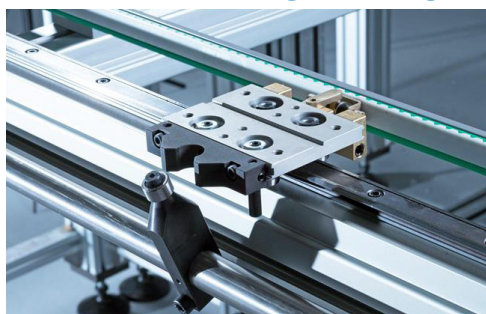
HepcoMotion® DTS from Bishop-Wisecarver® with position-lock option for added precision.

What if a higher degree of precision is required? Multi-step processes may require indexed motion that is highly repeatable. The machine may stop at intervals to perform scanning, labeling, filling, assembly, or other operations.