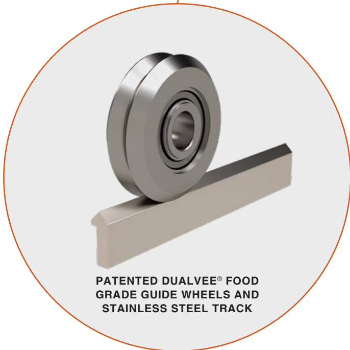
PATENTED DUALVEE® FOOD GRADE GUIDE WHEELS AND STAINLESS STEEL TRACK